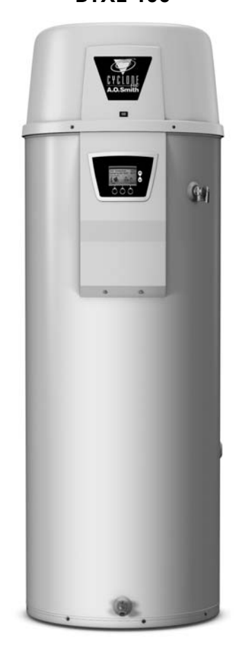
Model Shown BTX-100 Series 130/131